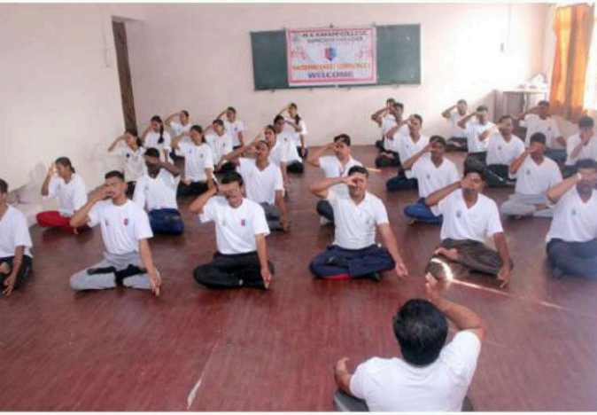
आंतरराष्ट्रीय योगदिनी योग करताना विद्यार्थी