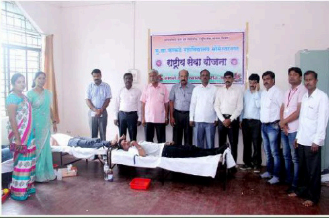
रक्तदान शिबिरात रक्तदान करताना विद्यार्थी व मान्यवर