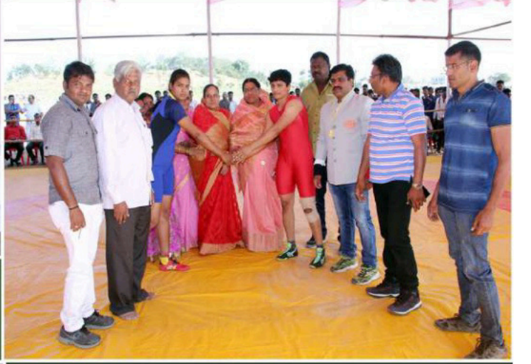
विद्यापीठस्तरीय मुलींची कुस्तीस्पर्धा उदघाटनपर कुस्ती लावताना मान्यवर