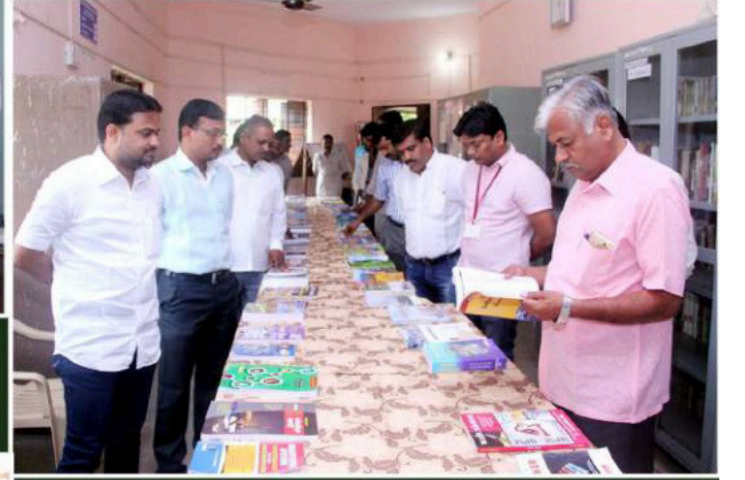
ग्रंथालयातील पुस्तक प्रदर्शन