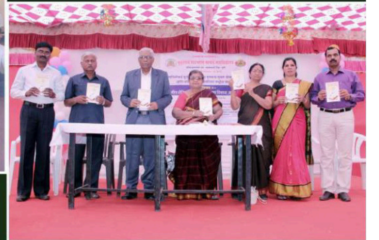
राष्ट्रीय चर्चासत्रातील (मराठी)शोधनिबंधाचा संपादित संदर्भग्रंथ प्रकाशन सोहळा